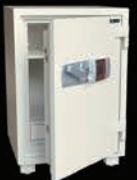
1 Lockable Drawer 1 Adjustable Shelves