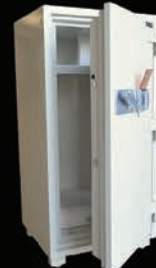
1 Lockable Drawer 3 Adjustable Shelves

Model No.: DS110-DS-(ELECTRONIC) Outside Dimension: 1110 x 610 x 586mm Inside Dimension: 850 x 430 x 376mm Weight (Approx.): 226 kgs Color : Shell White