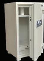
1 Lockable Drawer 2 Adjustable Shelves